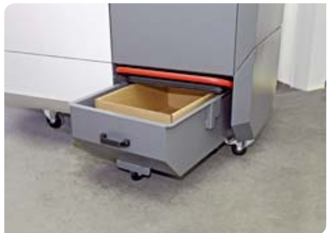
The mobile 90 litre dust collection drawer can also be transported using a lift truck or fork lift.