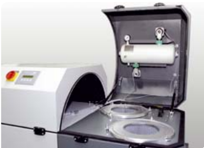
The top of the filter module is hinged so as to provide convenient access for service and maintenance work.